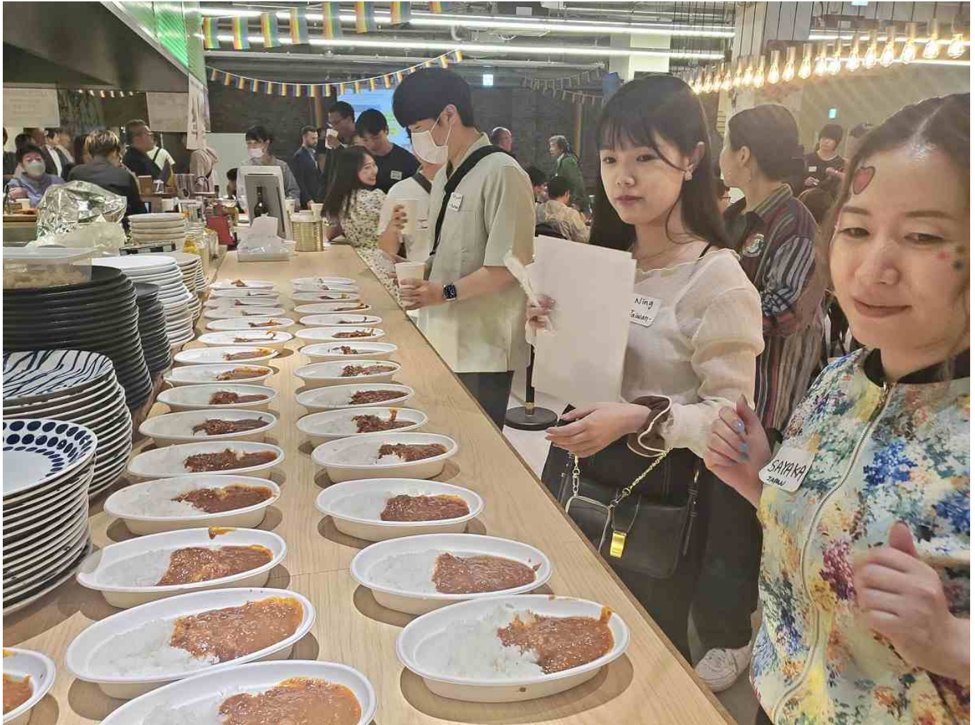
Students from various countries interact at an International Cafeteria event in Naniwa Ward, Osaka.